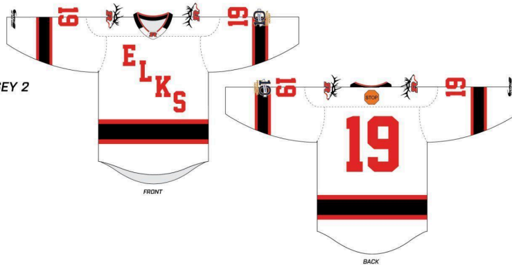
WHITE JERSEY 2

FOR PROOFING ONLY. THE COLOR, SIZING AND SCALE MAY NOT BE DEPICTED ACCURATELY