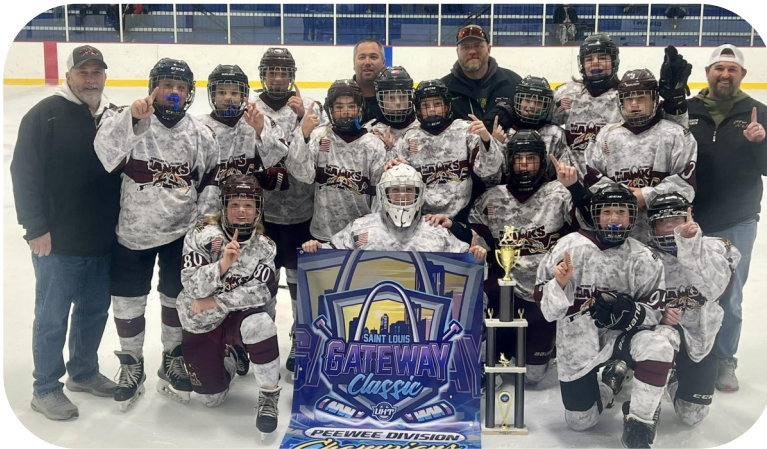
12U - A1