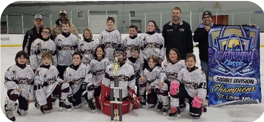
10U - C2