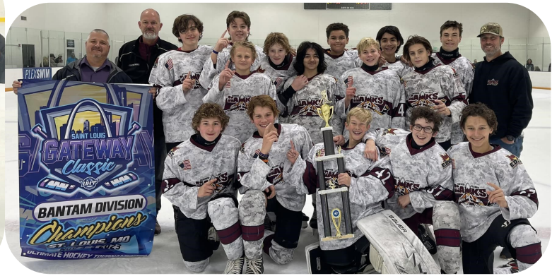
14U - A2