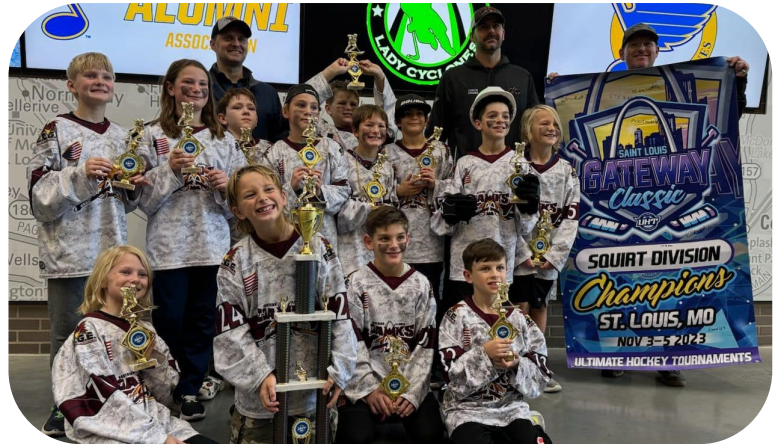
10U - B2

St. Louis Gateway Classic SO MANY CHAMPIONS!!!!