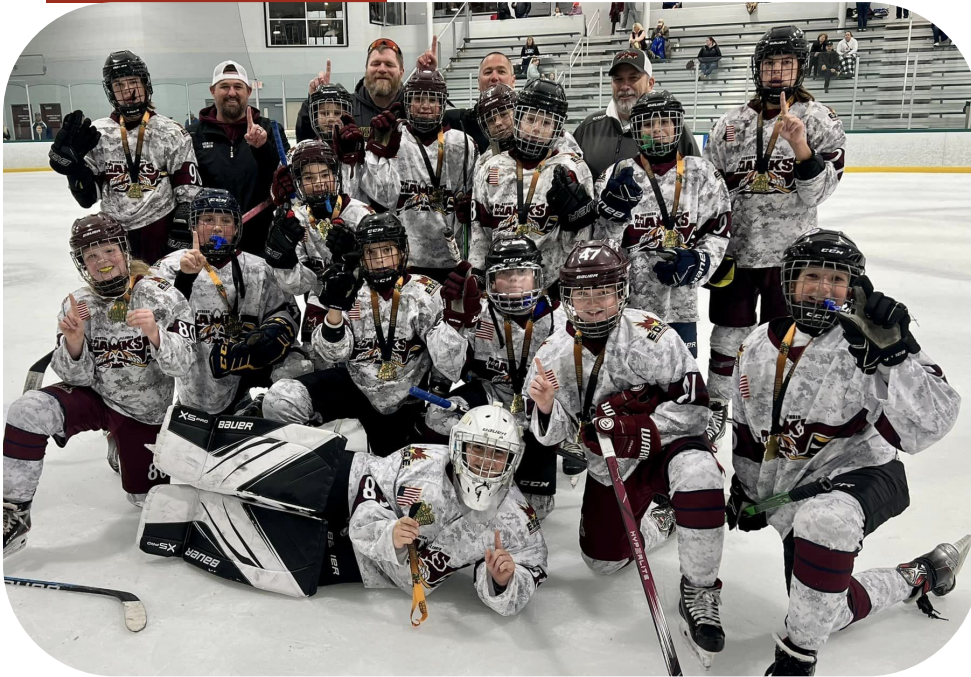
Grinder Goblin Champs

If you have a parade moment to share email us at: SocialMedia@IceHawksHockey.org