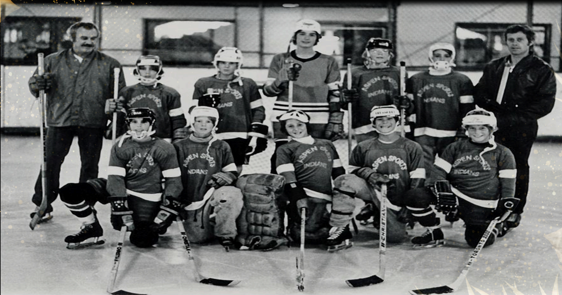
AJH first Pee Wee team 1972