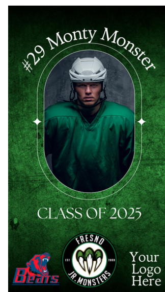
Senior Banner Example 2' L x 3' H

Sponsors at any of the levels above will support the Fresno Junior Hockey Club at a Club level, offsetting costs to all players in the Fresno Junior Hockey Club's different programs and tournaments. In appreciation of your efforts, all sponsorship levels above include a "finder's fee" that will be credited to the individual player's account once the sponsorship is successfully processed. For all levels—except "The Hat Trick"—this fee is 50% of the sponsorship amount. "The Hat Trick" level includes a 25% finder's fee. We also offer Team Sponsorships and Individual Player Sponsorships.