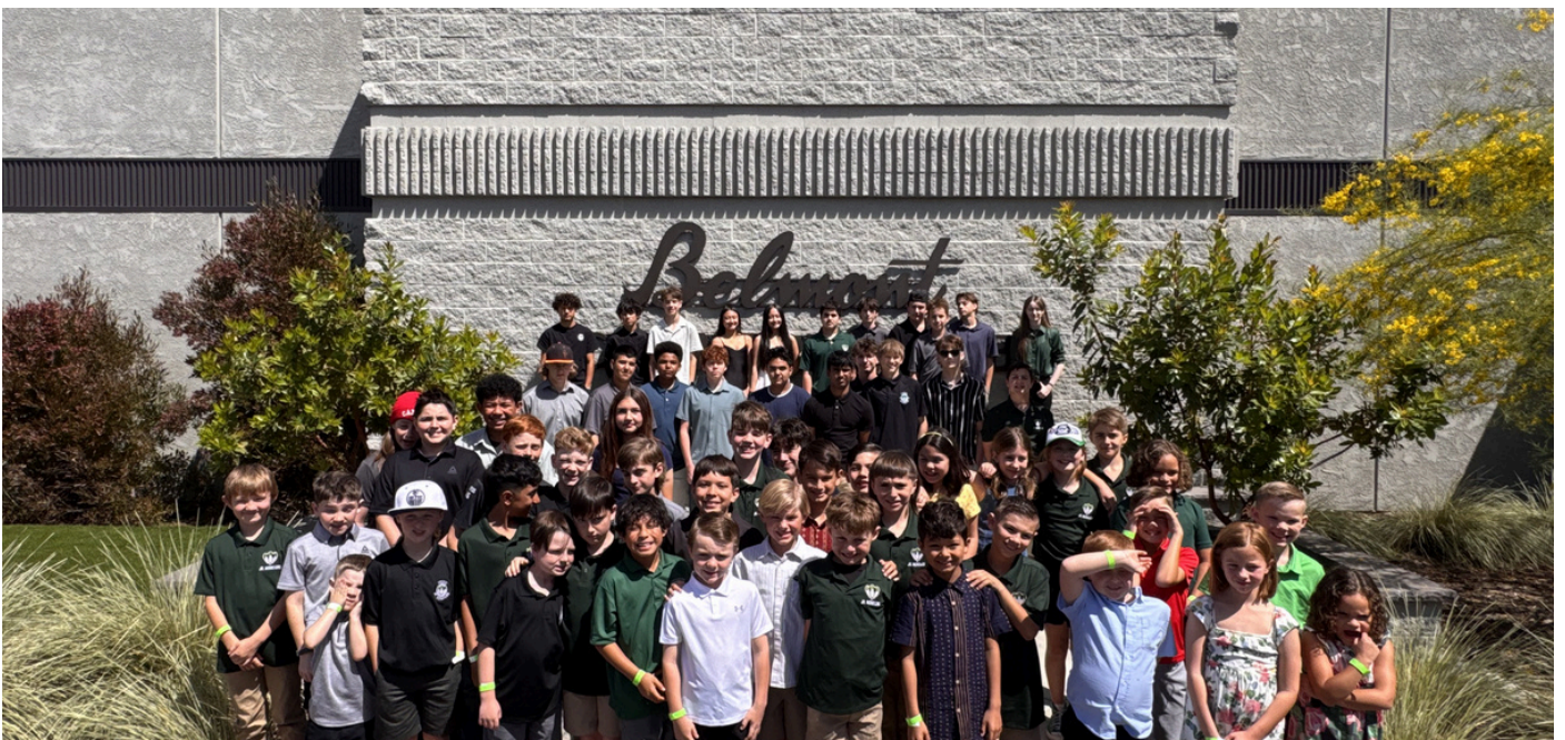
Image from 2025-2026 Banquet

At the heart of our mission is a commitment to advance and encourage recreational, amateur sports within our community. We strive to develop, promote, and regulate the sport of ice hockey while emphasizing its role in nurturing sportsmanship, character, and leadership among children and young adults. Through our dedication to these values, the Fresno Junior Hockey Club continues to inspire the next generation of athletes and foster a lifelong passion for hockey. Our ambition is building a solid foundation for skill development on the ice in addition to teaching core values that can be utilized throughout their life journey.