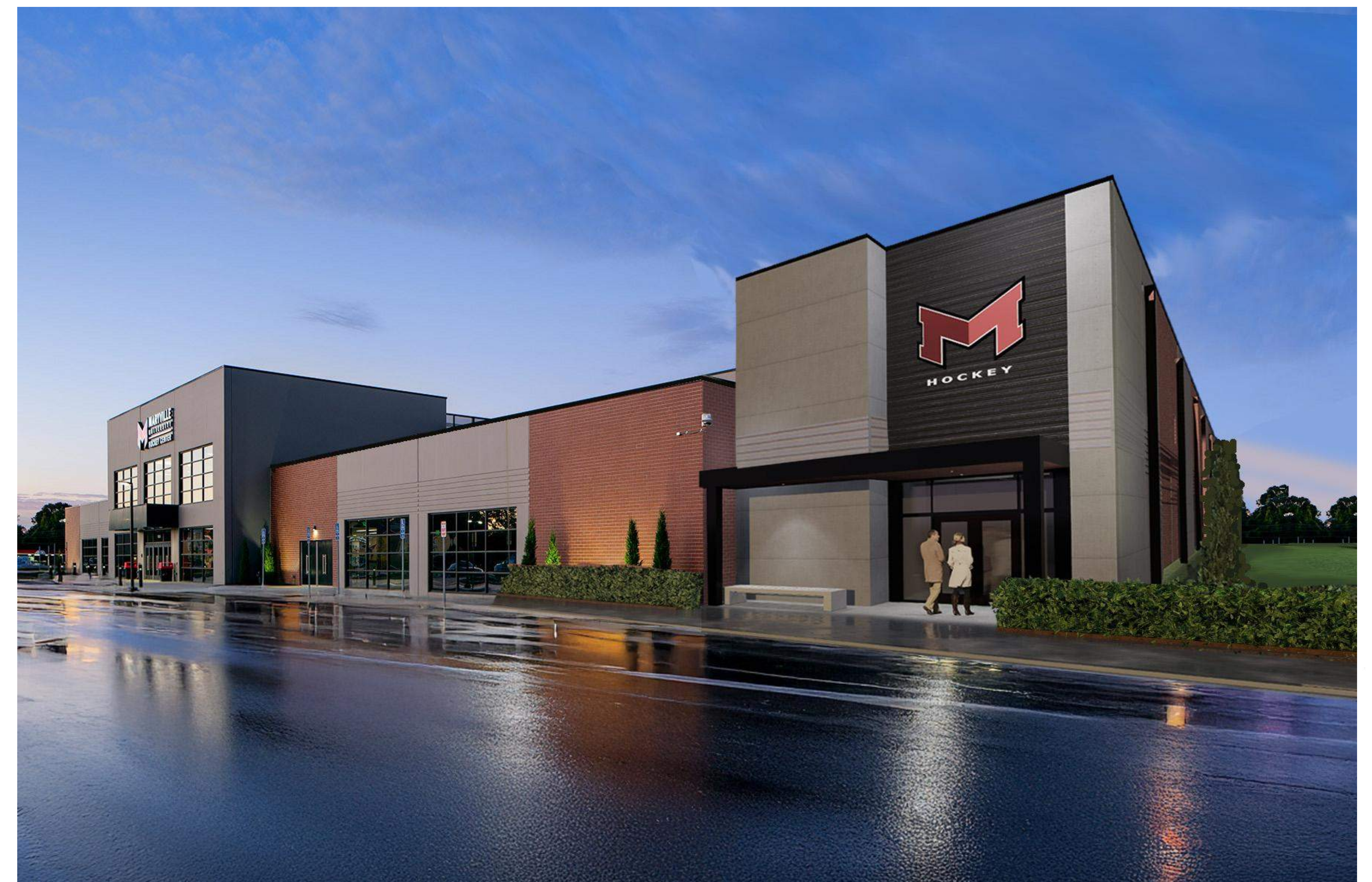
EXTERIOR ENTRY - AMENITIES BUILDING ONLY