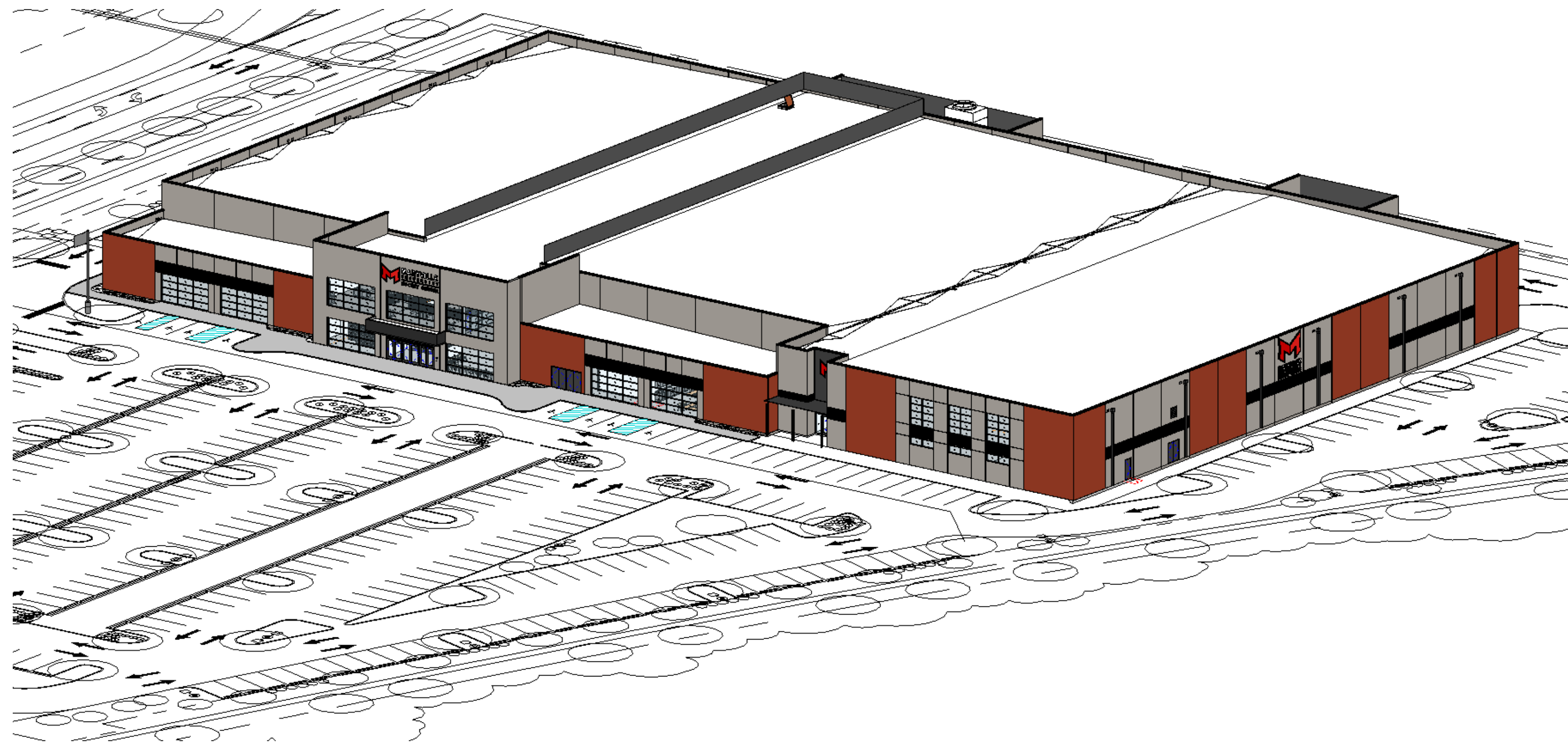
3D MODEL - NORTHEAST CORNER