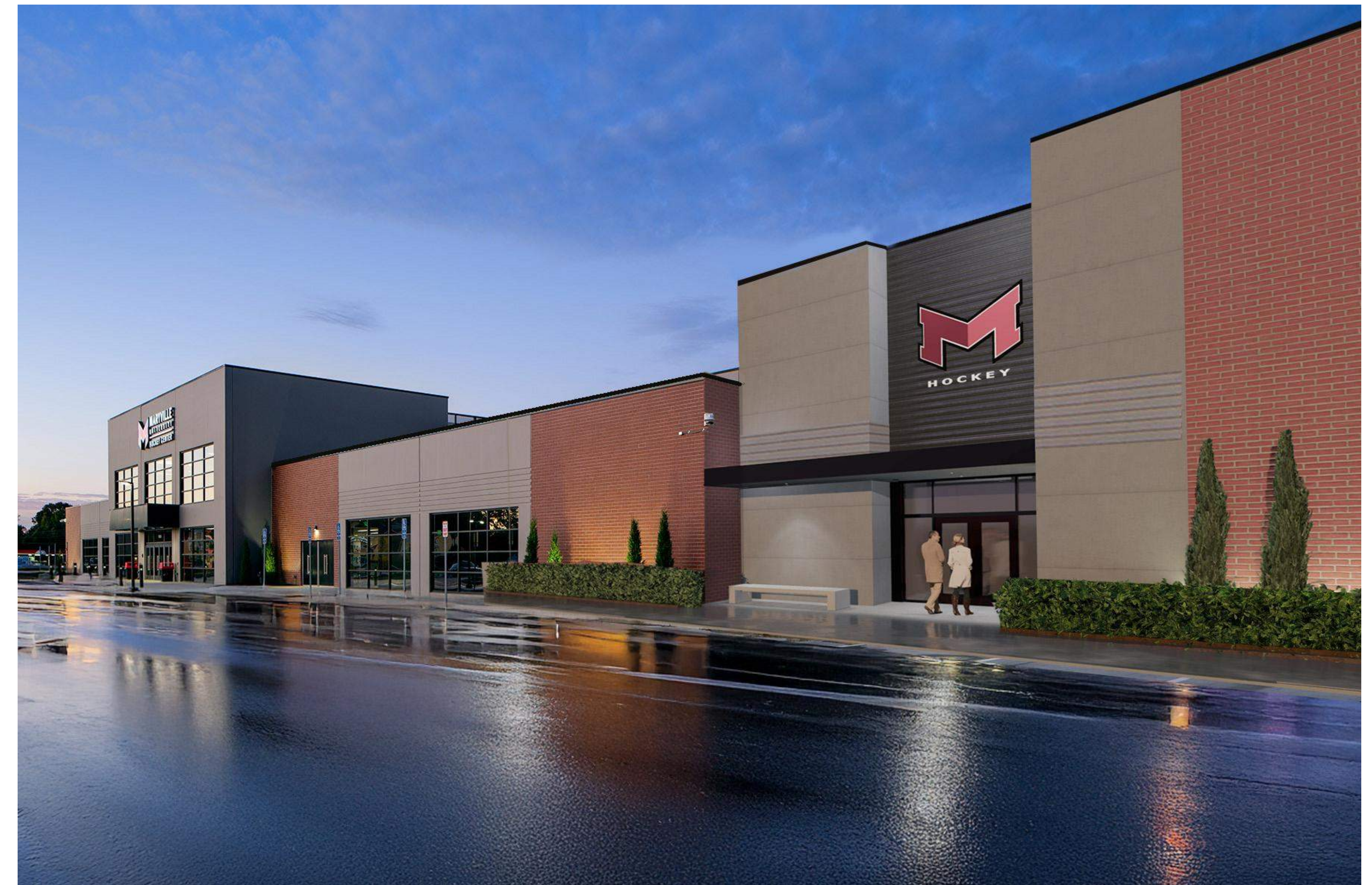
EXTERIOR ENTRY - THIRD RINK AND AMENITIES BUILDING