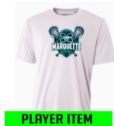
Mustangs Lacrosse Performance Short Sleeve Shirt A4 | 3142mustangs $16.00