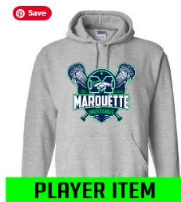
Mustangs Lacrosse Hoodie Jerzees | 18000mustangsscrew $27.00