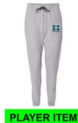
Mustangs M logo Jogger Jerzees | Mjogger $30.00