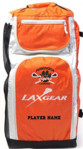
Farmington Orange Laxpack

Farmington bags with logo and player name.