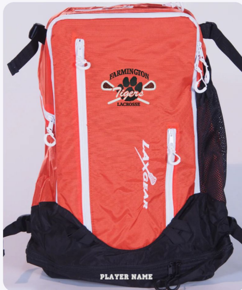
Farmington Orange Mini

Farmington bags with logo and player name.