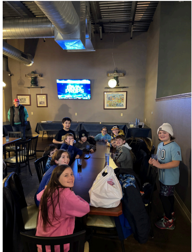
Squirt A went to WOW for laser tag