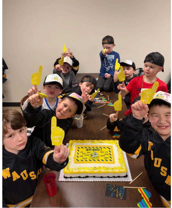
Bantam A and Mite White1 teams coincidentally ended up having their team bonding sessions at Sam's Pizza on the same night.