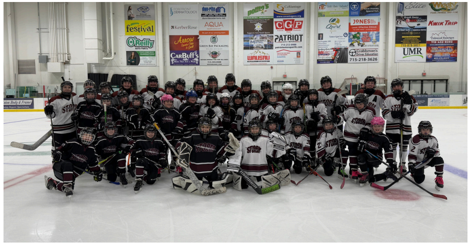
10U teams at Future Storm Night