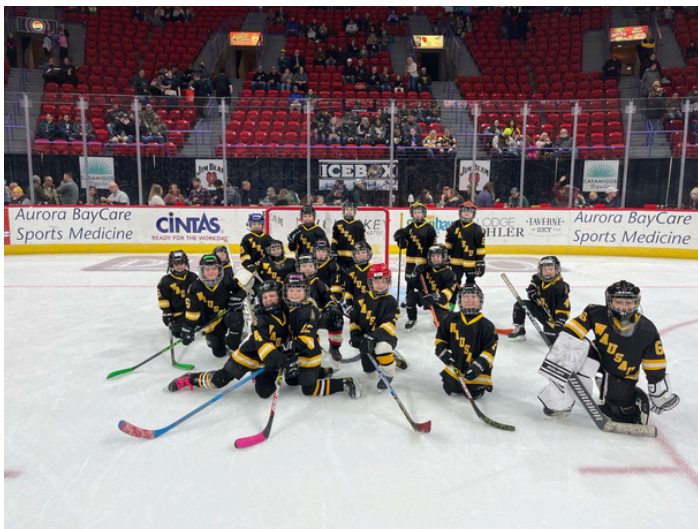
A group of Mites skated prior to a Gambler's game in Green Bay