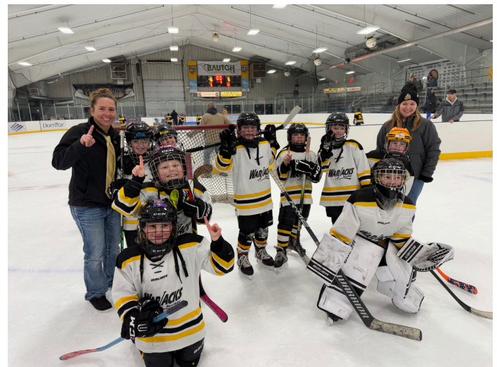
A team from the 2025 Mite Mash Up