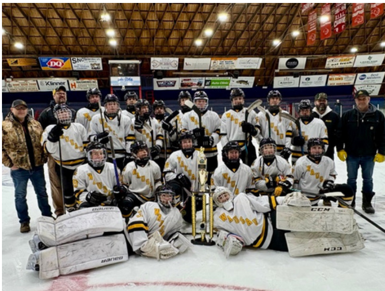
Bantam A took 1st place at the Eagle River tournament!