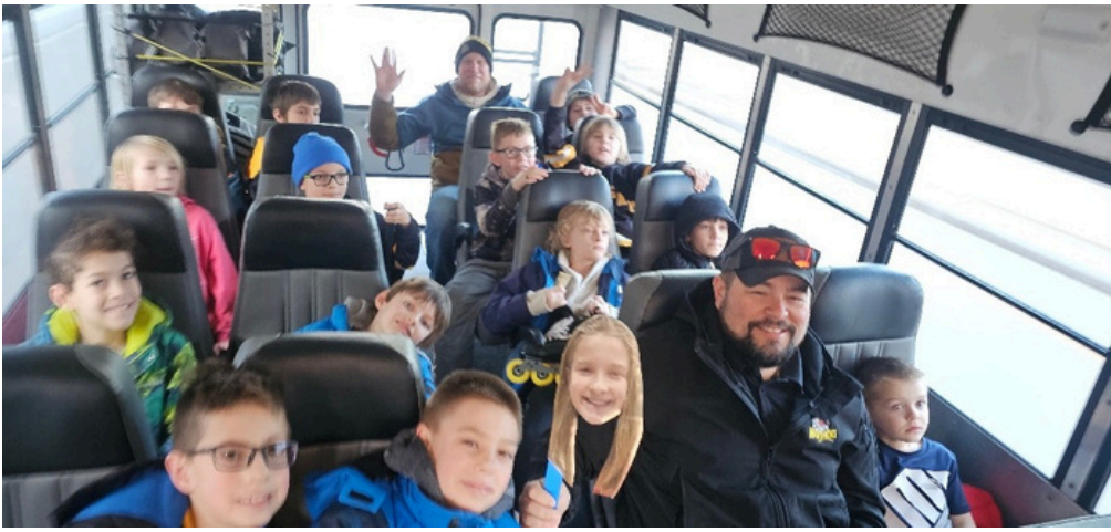
Squirt C went on a bus adventure to Skate City