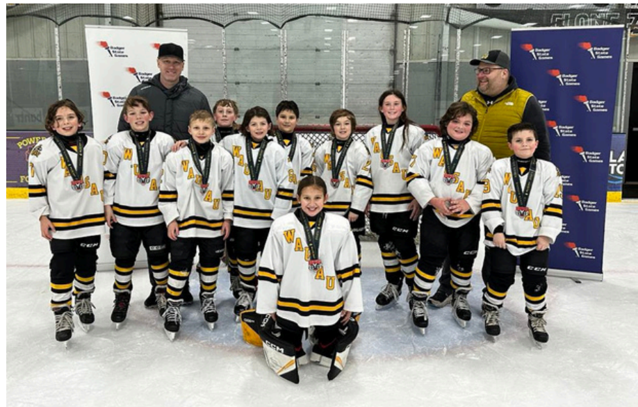
Squirt A took 2nd place at Badger States Games in January