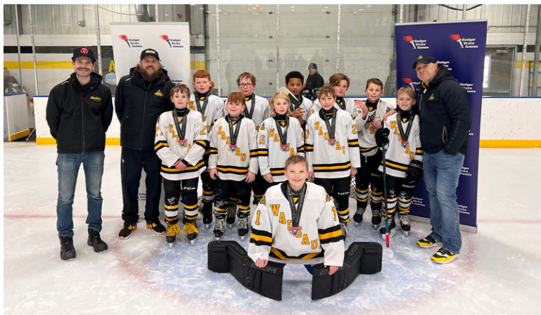
Squirt B took 2nd place at Badger States Games in January