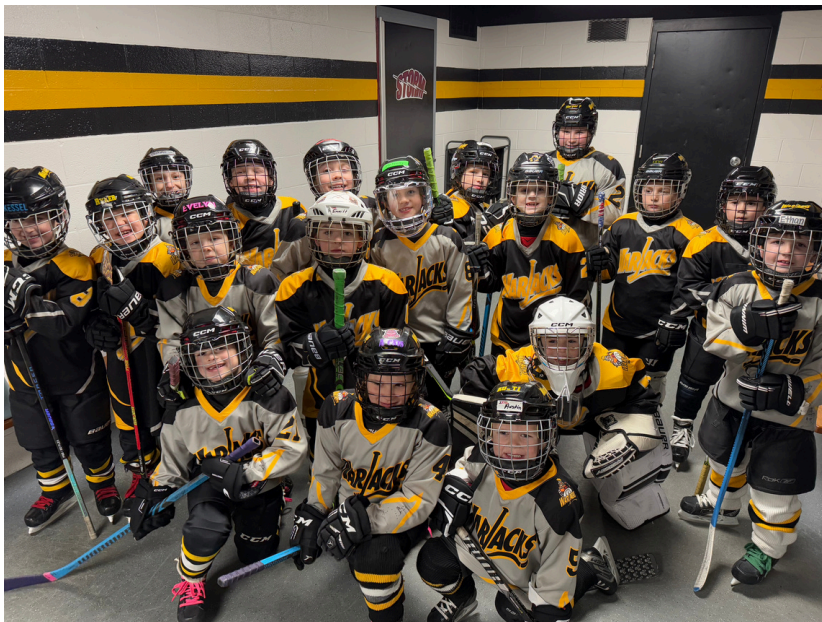
Mites at Youth Hockey Night with the EMU & West hockey teams