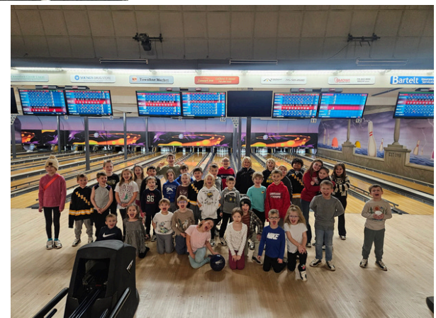
6U Team Bonding