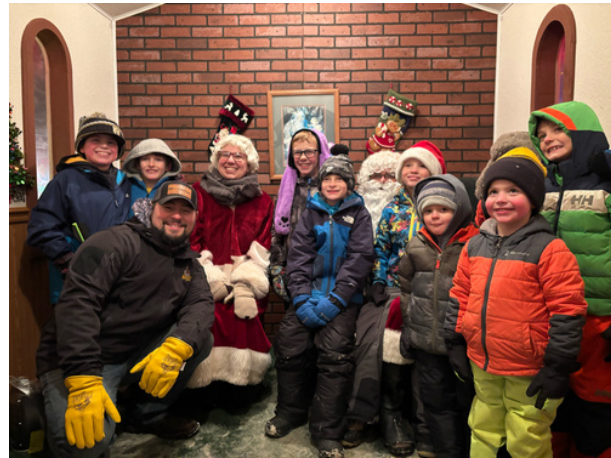
Squirt C at Marshfield Zoo