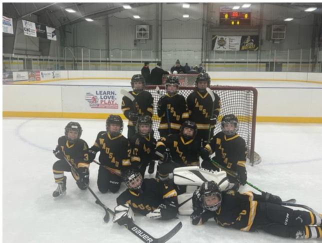
Mite Reds at the Holly Jolly Jamboree