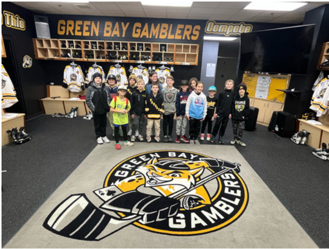
Squirt A at the Green Bay Gamblers