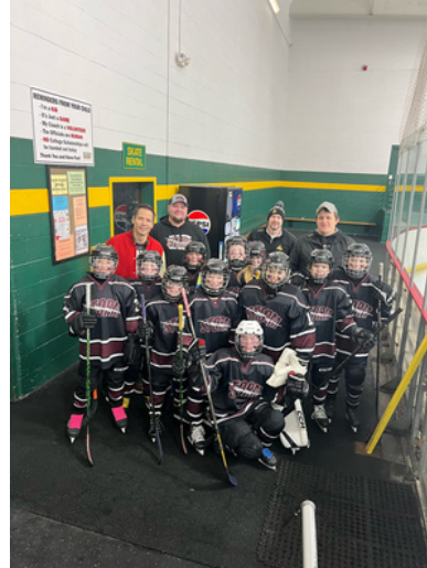
10U Gold before their game in Green Bay