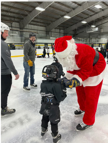
Santa made his annual trek to Wausau to skate with the Learn to Skate kids.