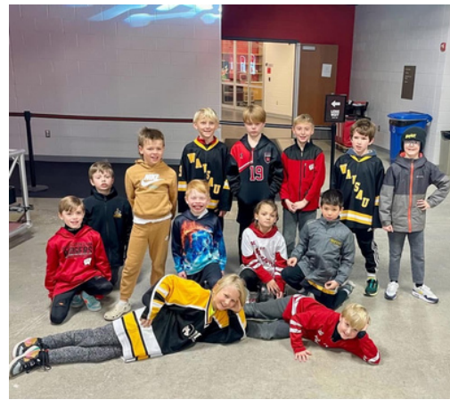
Mites before their Mighty Mite Skate before the WI Badger Game