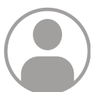
Future Tournament Director

Elected Voting Board Position (3yr. term)