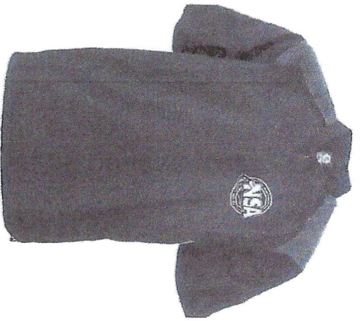
Moisture management / anti-microbial technology 100% Polyester $40