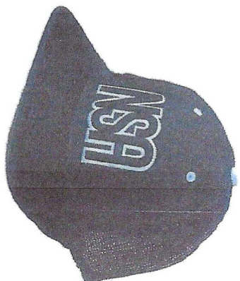
NSA FLEX FIT MESH COMBO HAT SM / MED or L / XL $25