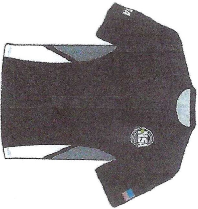
NSA SUBLIMATED BLACK DRI FIT UMPIRE SHIRT $35