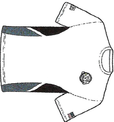
NSA SUBLIMATED WHITE DRI FIT UMPIRE SHIRT $35